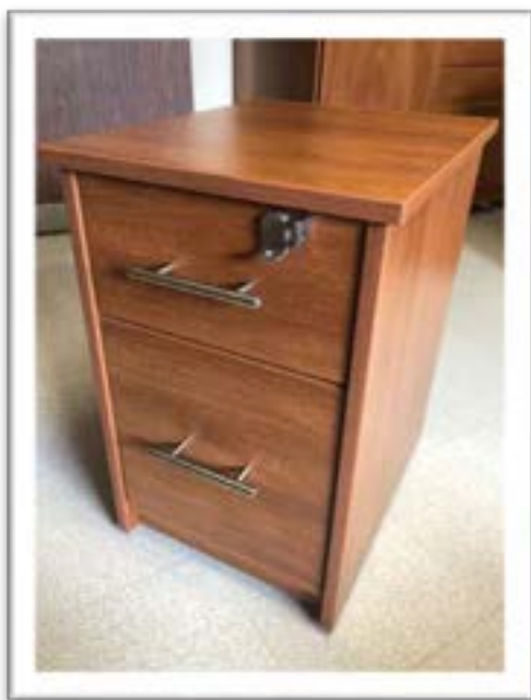
Desk drawer that doubles as nightstand. Top drawer locks with your own padlock!

Note items may vary in Lynch Hall, Varsity Village. Furniture aesthetic is different in Clet Hall and Apartments.