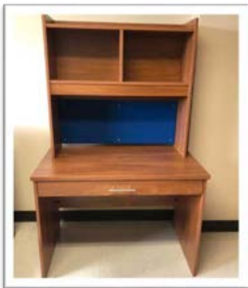
Desk, shelves, tackboard, matching chair.