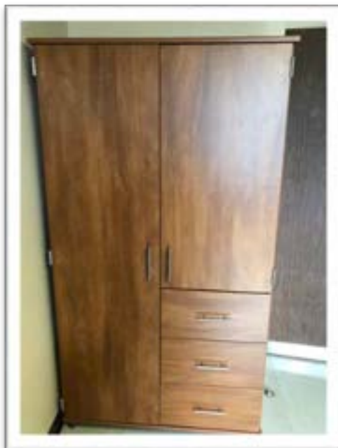
Armoire. 3 drawers and two bars to hang clothes.