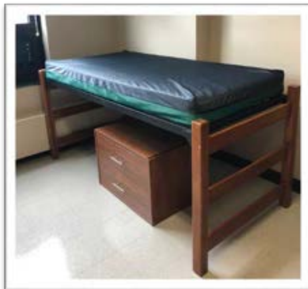
Adjustable height standard TWIN bed with memory foam mattress. Each side is different firmness.