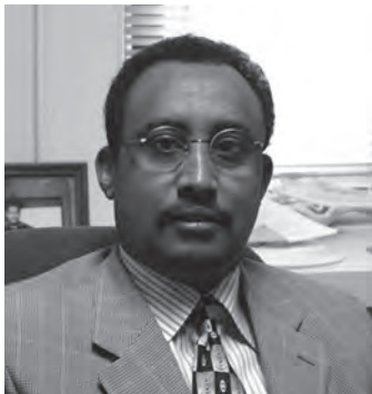
Dr. Abdiweli Ali

When Dr. Abdiweli Ali, an associate professor of economics, was appointed to be Somalia's Minister of Planning and International Cooperation last fall, he took a sabbatical from NU for the spring 2011 semester. It is now confirmed that Dr. Ali's stay in the African nation will extend into a yearlong leave of absence as he was named Somalia's prime minister on June 23, 2011, following the removal of Mohamed Abdullahi Mohamed.