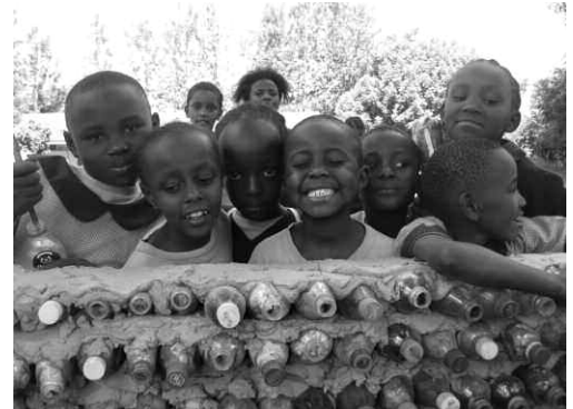
Kenyan children and the schoolyard wall they built with recycled materials.

For additional information on how to self-design a 33-credit hour master's degree that fulfills your passion in life, go to www.niagara.edu/interdisciplinary/index.htm .