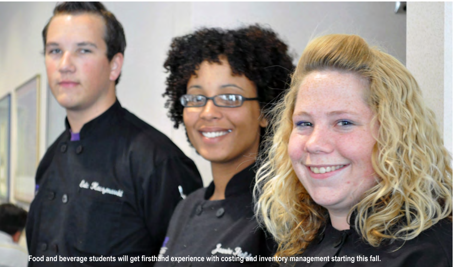
Food and beverage students will get firsthand experience with costing and inventory management starting this fall.