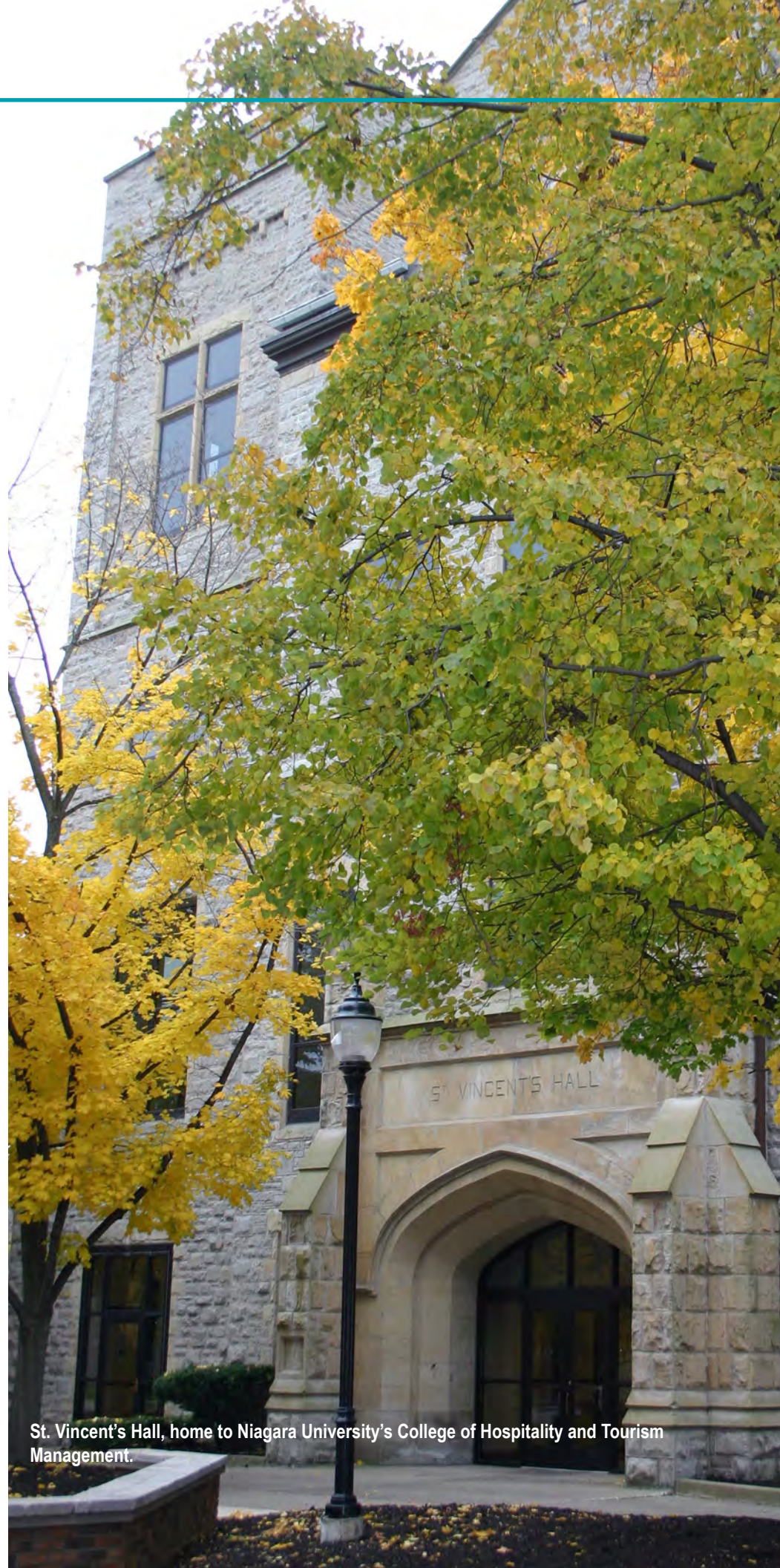
St. Vincent's Hall, home to Niagara University's College of Hospitality and Tourism Management.