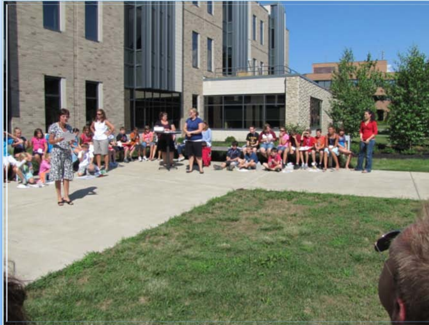
Literacy/STEM Camp August 1-4, 2011