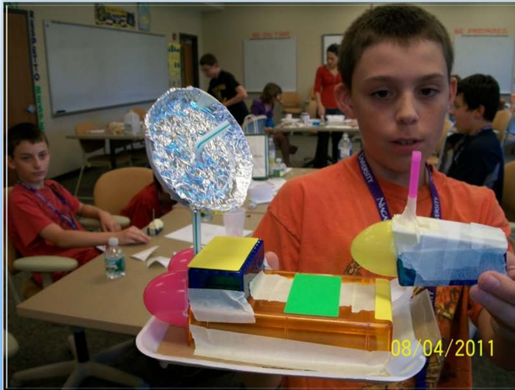
Literacy/STEM Camp August 1-4, 2011