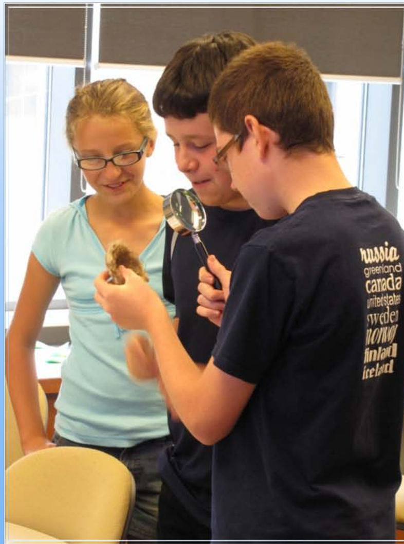
Literacy/STEM Camp August 1-4, 2011