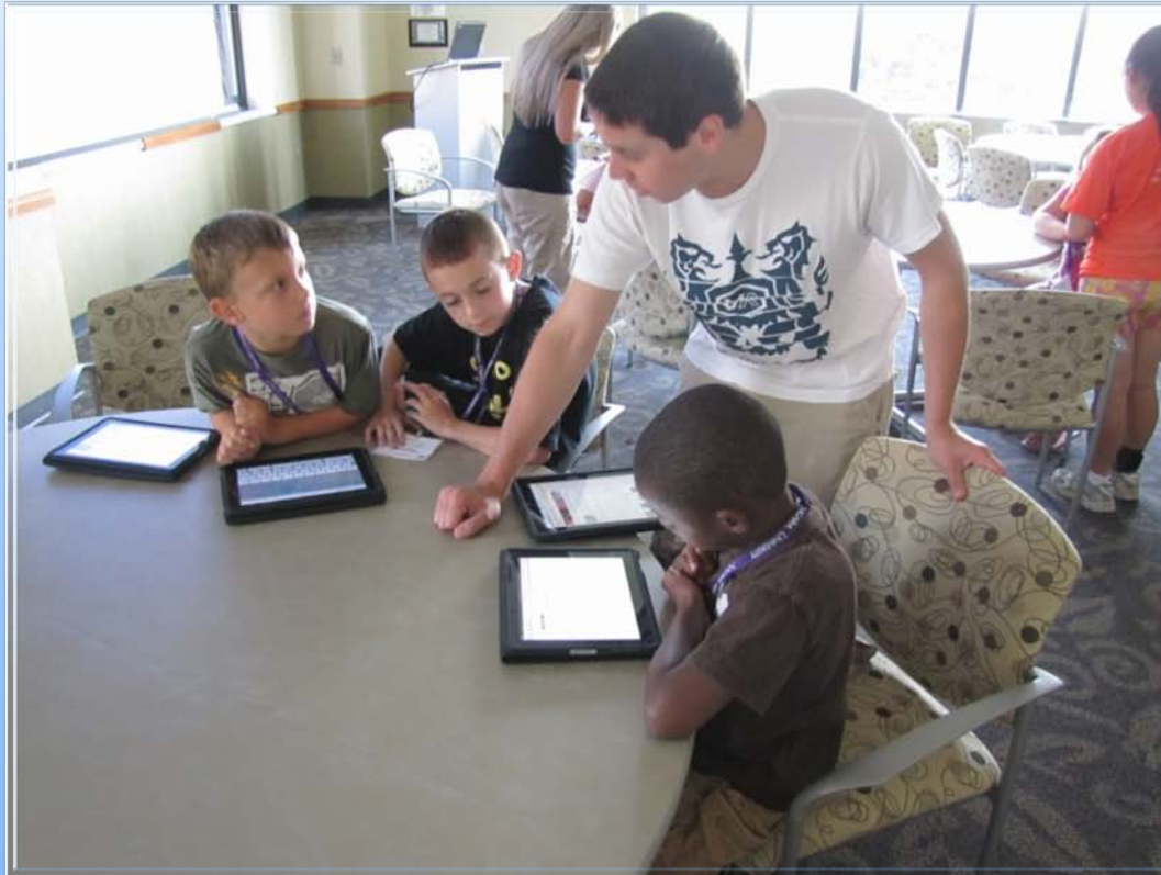
Literacy/STEM Camp August 1-4, 2011