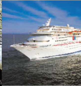
Above, photo courtesy of Carnival Cruise Lines.

Niagara Fact: Among Niagara's Class of 2005, all hotel and restaurant management majors were employed within six months of graduation, with 70 percent earning starting salaries of at least $35,000.