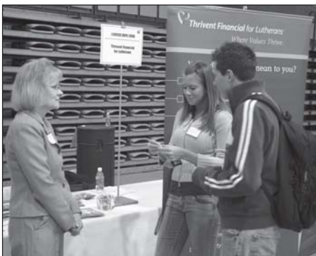
A local recruiter discusses career opportunities with two Niagara students at Career Expo 2006.