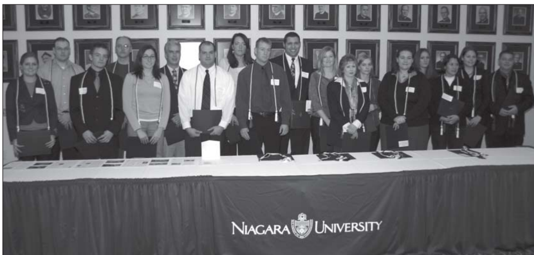
The newest members of NU's chapter of Kappa Gamma Pi, the National Catholic College Graduate Honor Society.