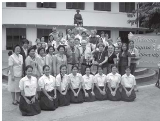
Pictured are Niagara University graduate students and faculty visiting Rajinibon Girl's School in Bangkok, Thailand, along with faculty and administrators from the school.

On the return to Bangkok, students spent several days visiting schools within the city and