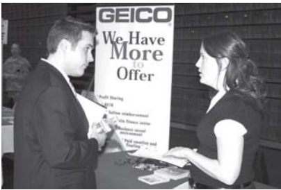
A Geico representative talks with a Niagara student about job openings.