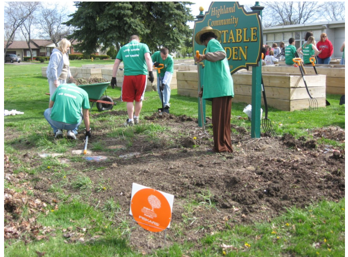
(Left: Painted “tree” rain barrel designed by MLK Service Day: Paint the Rain student volunteers Right: Community volunteers hard at work during the Highland Community Clean Up in April 2010)