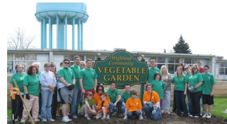
Below: Highland Community Clean Up @ HCV Garden

Folks in Highland are really getting into the “green” of things by cleaning the streets and growing food for the community with help from residents throughout Niagara Falls. On April 24th, 2010, community members volunteered to pick up trash, lay down mulch, and work at a community vegetable garden as a part of the Highland Community Clean Up. The Highland Community Clean Up was a collaborative effort support by various Highland and Niagara Falls organizations and was a clean up site included in the larger citywide Beautify Niagara event that took place the same day. Over 80 people came out to “spruce up” Highland!