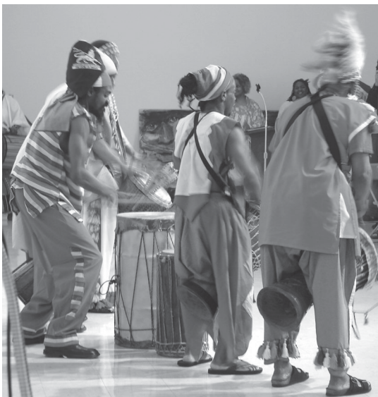
Performance by Le Ballet Touba N'Dame Fall.

The African Education Alliance of WNY held African Night at Niagara University's Castellani Art Museum on April 19, 2008. The event served to introduce Africa in its cultural diversity to Niagara and to Western New York, as well as to raise funds for scholarships to support African immigrant and refugee students who demonstrate outstanding academic achievement and civic attitude in their host community.